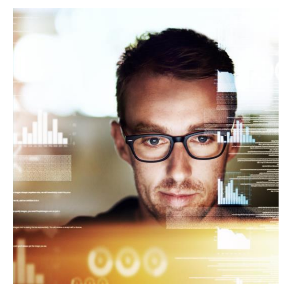
Thetica Systems Company Overview